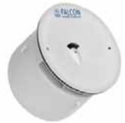
Patented, sealed cartridge is made of recyclable ABS and uses a biodegradable sealant liquid to control odors.

When it comes to urinals, nothing compares to the technological innovation and unsurpassed performance of Falcon Waterfree urinals. Falcon Waterfree urinals offer numerous benefits that will make your job easier and help fulfill your strategic facility plan. Falcon Waterfree urinals reduce water and sewer costs, maintenance and repair bills, and create more hygienic, odor-free restrooms. A patented, sealed cartridge eliminates the need for water, conserving up to 40,000 gallons or more per unit each year. Pipe-in-pipe technology guarantees excellent flow even when installed in most older horizontal pipe nipples with flat or negative slope. All maintenance costs and vandalism problems associated with flush valves are also eliminated.