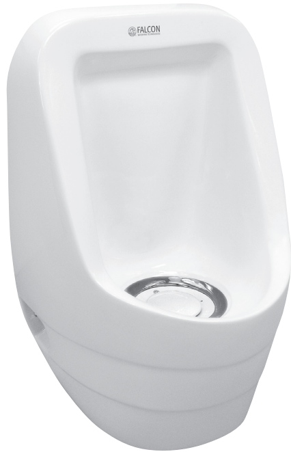
WATERFREE URINAL VITREOUS CHINA